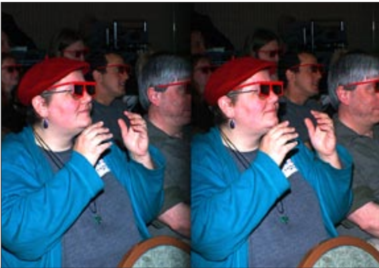
Everyone dons their funny polaroid glasses for the stereo theater